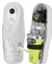
Category I Bracket